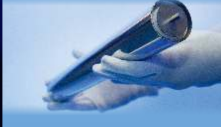
SCSS individual cell rated at 2.58 V each