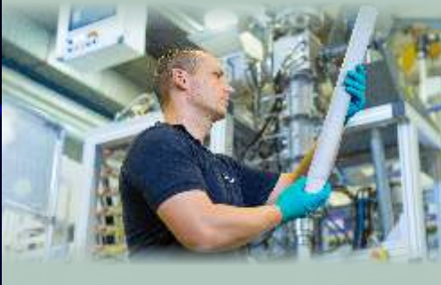
Ceramic solid-state electrolyte at Fraunhofer pilot plant facility