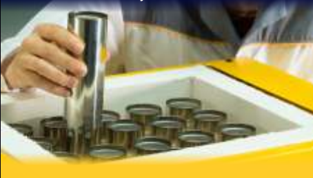
SCSS cells in battery module