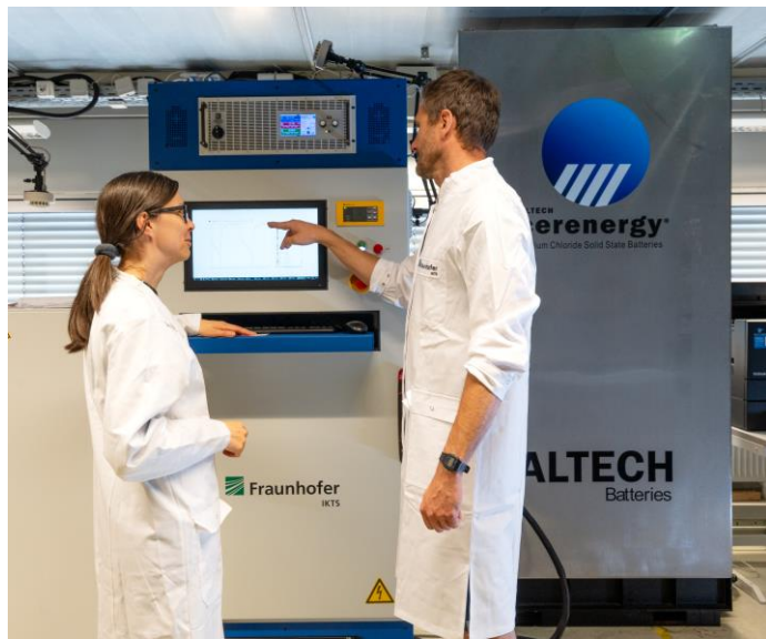
Photo: Prototype 60 KWh battery being assembled and tested at Fraunhofer IKTS laboratory